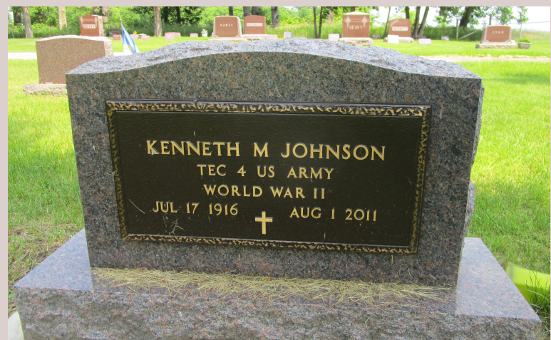
Added by: Janet Marie