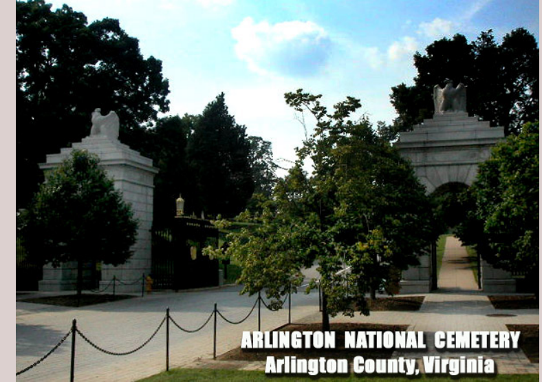
Cemetery

Arlington Arlington County Virginia, USA