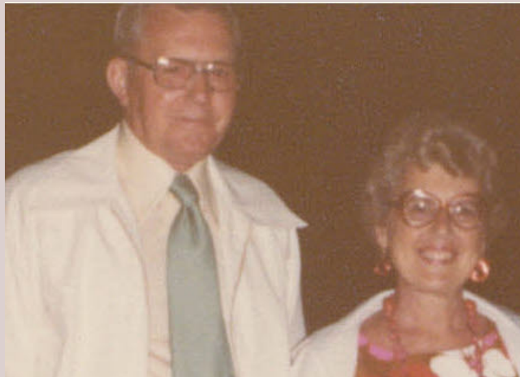
Added by: Our Connections

Funeral services will be held at the Kevin A. Beardsley Funeral Home, Clearfield on Friday