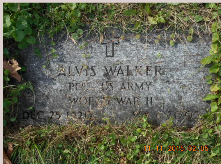
Added by: Dan Francis